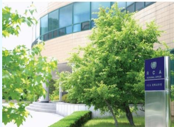
Relocation of RCARO in 2007