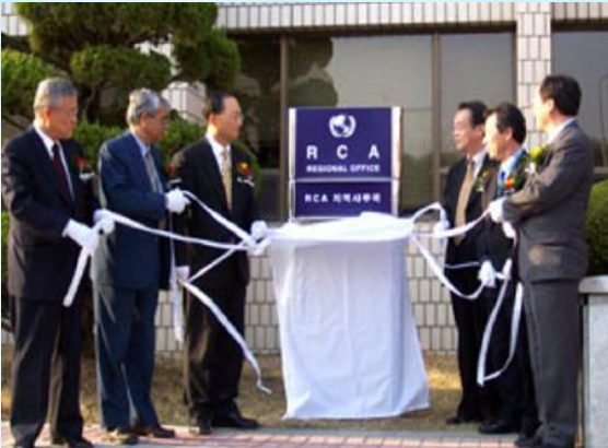
Opening of RCARO in 2002