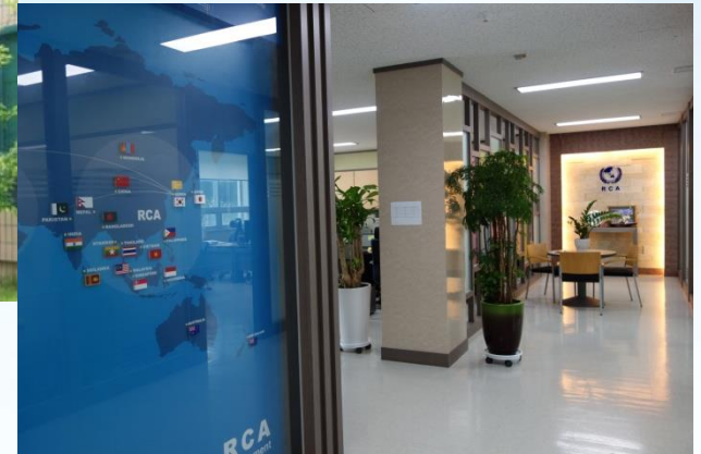
Relocation of RCARO in 2013